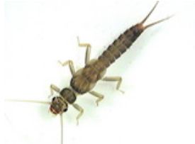
little green stonefly