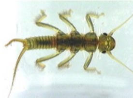
little yellow stonefly