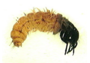
northern case-maker caddisfly