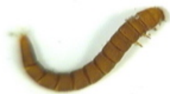
riffle beetle larva