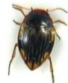
predaceous beetle adult