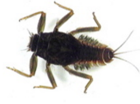
spiny crawler mayfly