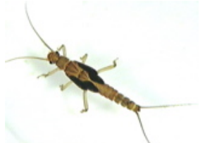
slender winter stonefly