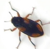
riffle beetle adult