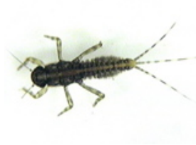
spiny crawler mayfly