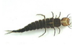
predaceous beetle larva