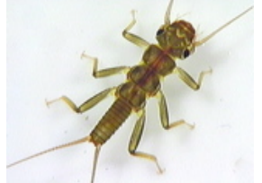
little yellow stonefly