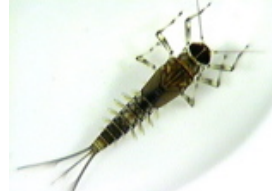
small minnow mayfly