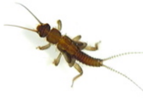
little brown stonefly