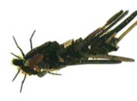
northern case-maker caddisfly