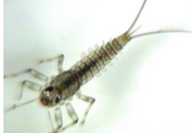
small minnow mayfly