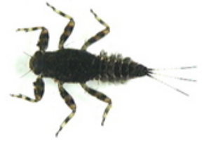
spiny crawler mayfly